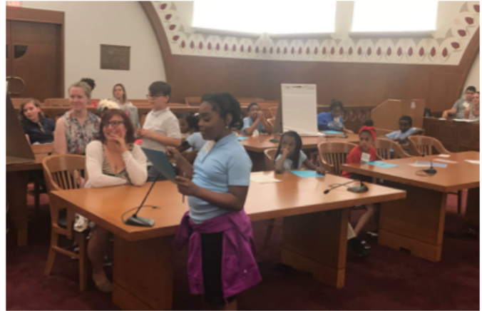
4 th Grade students from Fletcher Maynard participate in a mock hearing about immigration.

As part of the district's partnership with Children Discovering Justice , elementary students from five CPS schools participated in mock trials at the Moakley Courthouse this year.